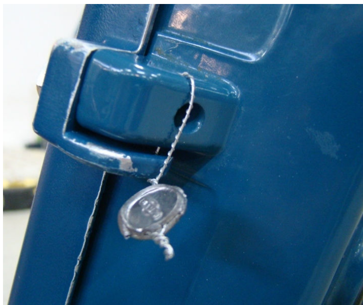
Figure 1: Masterload III Indicator Unit with sealing