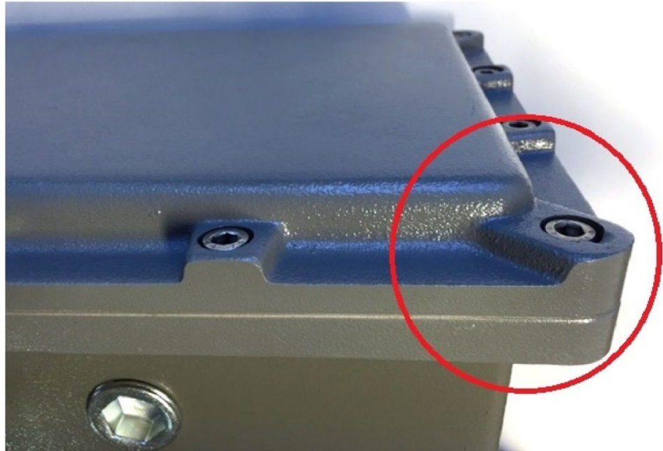
Figure 3: Masterload III Processor enclosure for Ex Area with sealing (through any one of the cover bolts)