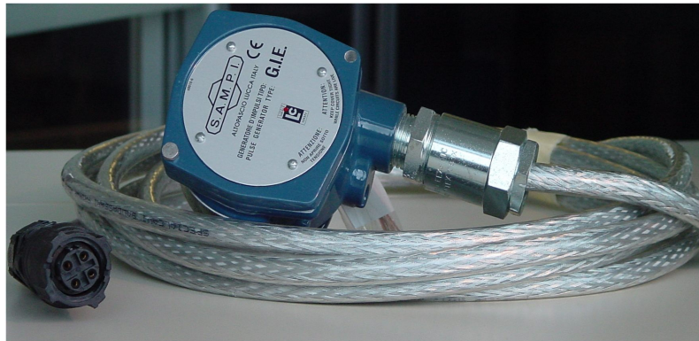
Figure 4: Example of pulsers with sealing