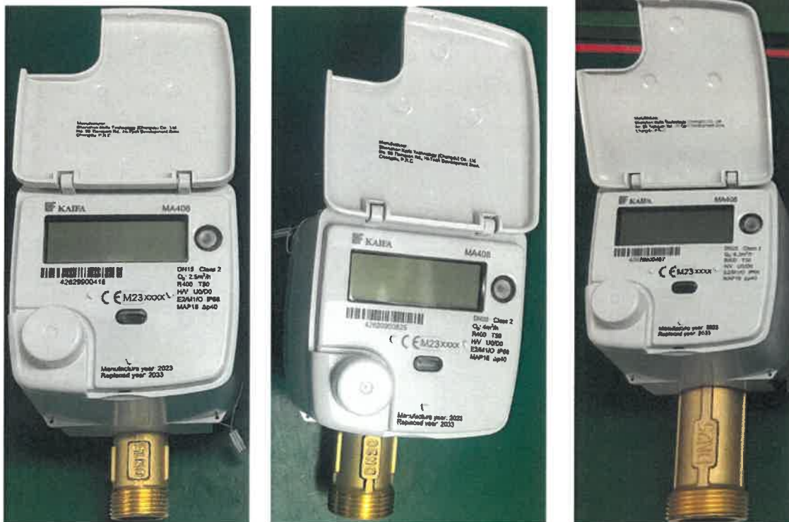
Fig. 1: Illustrative views of the water meter type MA408